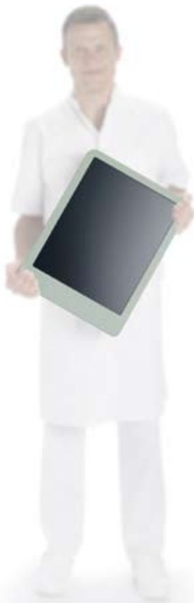
Flex Focus is mobile ultrasound.

Flex Focus loves to go wherever you go. On the wall, on your desk, in your car and even on an airplane. With the Flex Focus, take your practice with you anywhere.