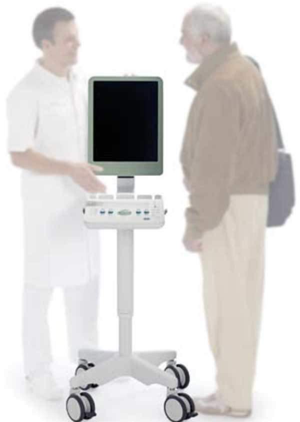
So your practice is right where you are.