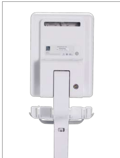
Superior cable management means no unsightly cables. Out of sight and out of the way.