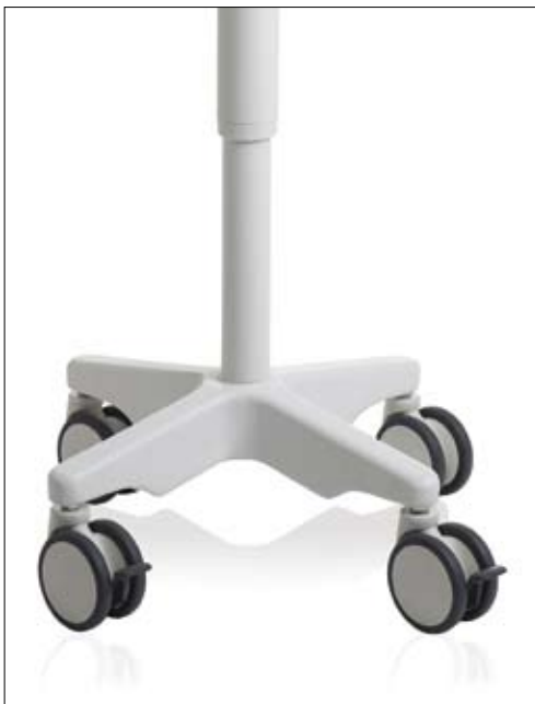
A solid system with a small footprint.