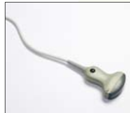
8830 Comfort and quality in abdominal ultrasound.

Gone are the days of a clumsy, unsophisticated solution. That's not what you need. In today's environment, image is everything. Mobile ultrasound has grown up, and that is what Flex Focus is — modern, mobile ultrasound.