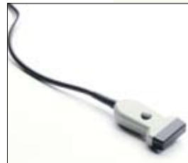
8670 Quality, versatility and convenience in one transducer.