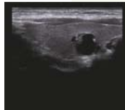
Thyroid with complex cyst