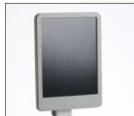
Image is everything. Beautiful images on a large, portrait screen.

Cable management like never before. Cables can easily be placed out of the way, yet are always within reach.