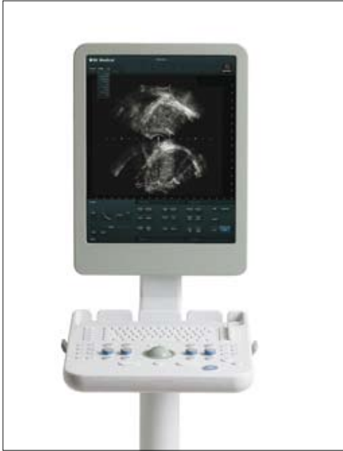
19" large portrait screen