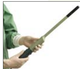
2052 Superb colorectal image quality - no matter where you look.