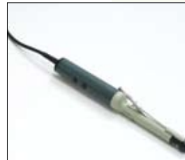
8818 Triplane - all prostate zones with one transducer.