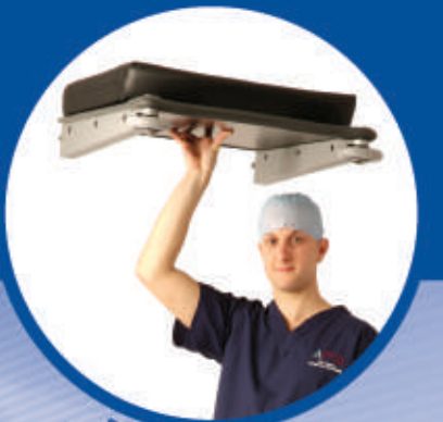
Removable ultra lightweight leg section