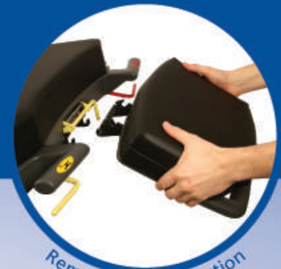
Removable head section