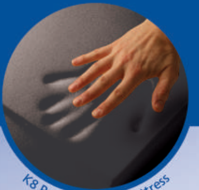
K8 Pressure Care mattress