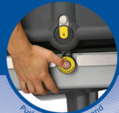
Push button release and self locking cot sides