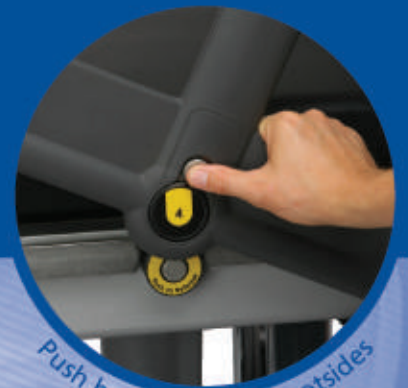
Push button rotating cot sides