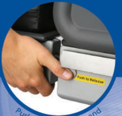
Push button release and self locking leg section